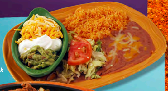
Chicken, Steak & Shrimp Fajita